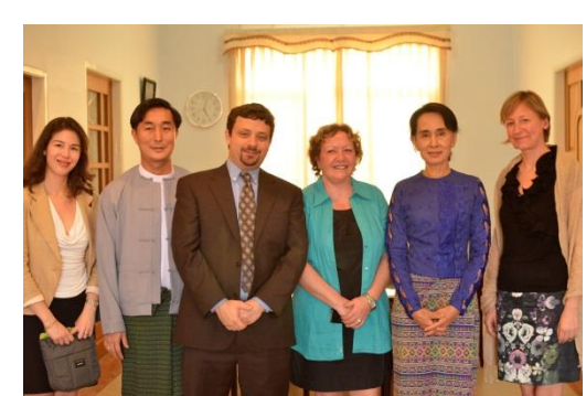
Beyond Access team members from the Asia Foundation, Myanmar Book Centre, IREX and EIFL visit with Nobel Peace Prize laureate and Myanmar MP Aung San Suu Kyi.

development process. We look forward to working with Myanmar public libraries in implementing some of the recommendations.