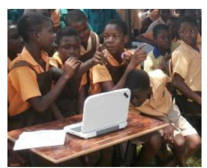
Lots to learn - Volta Regional Library takes fully-charged laptops to schools to give children hands on computer experience. Our fundraising appeal raised over US$5,400 to buy more laptops for this innovative service.

A big thank you to everyone who donated to Volta Regional Library's innovative mobile library service, which takes fully-charged laptop computers to schools in Ho, Ghana to help 450 schoolchildren pass their exams. Thanks also to everyone who shared our appeal with their friends and through their networks.