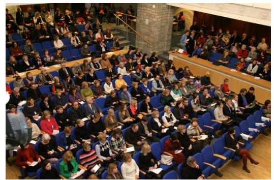
Digital Memory - final project seminar, January 2013

Estonia is in the process of revising its intellectual property laws, and the drafting of a new copyright bill is expected by September 2014. In an eight month project supported by EIFL-IP, the National Library of Estonia, the Consortium of Estonian Libraries Network (ELNET) and the Estonian Librarians Association worked to actively engage libraries in the planned new copyright law, and to inform the general public about emerging copyright issues that libraries face everyday, such as the lending of audio-visual works and e-books. The goal was to collaborate with legislators in developing workable solutions for legal problems that arise in the new technological environment.