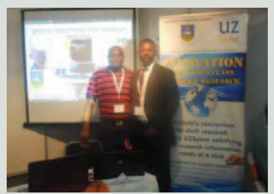
UZ staff present their project at the Zimbabwe International Trade Fair

Tools implemented included a Virtual Magnifying Glass and Balabolka, a text-to-speech tool. In addition, JISC TechDis (a UK advisory service providing advice and guidance on accessibility and