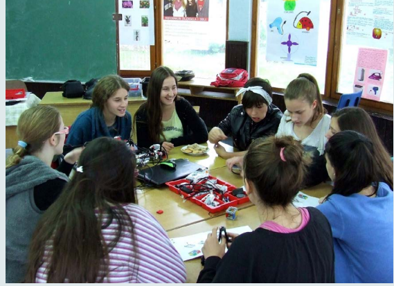
Girls take part in one of the library's robotics workshops in a local school.

With a small grant from the EIFL Public Library Innovation Programme, EIFL-PLIP (up to US$20,000), the library equipped a computer laboratory and introduced extramural IT classes in which young people learn basic and advanced coding skills for solving problems, developing web applications and programming robots to move. The participants learn through play in fun